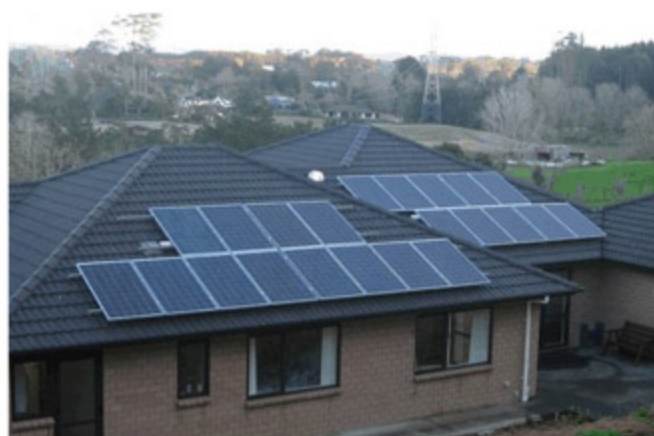
New Zealand 5kW